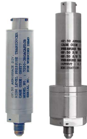
Shown at the left for pressure ranges 50 thru 15,000 psi, shown at the right for pressure ranges <50 psi.

All GP:50 Aerospace pressure transducers are manufactured and tested to the following MIL-STD and MIL-Spec standards to insure the highest quality assurance: